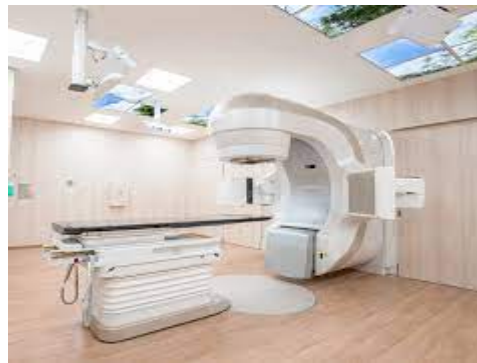
VARIAN TRUE BEAM