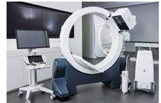
ELEKTA BRACHY SUITE