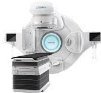
ELEKTA VERSA HD